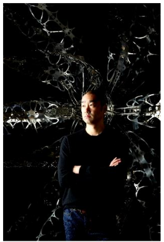
Choe U-Ram.