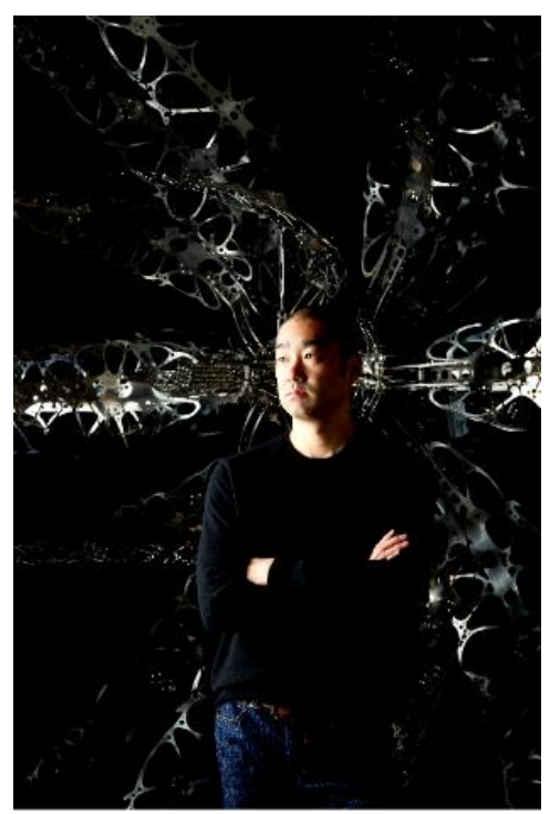
Choe U-Ram.